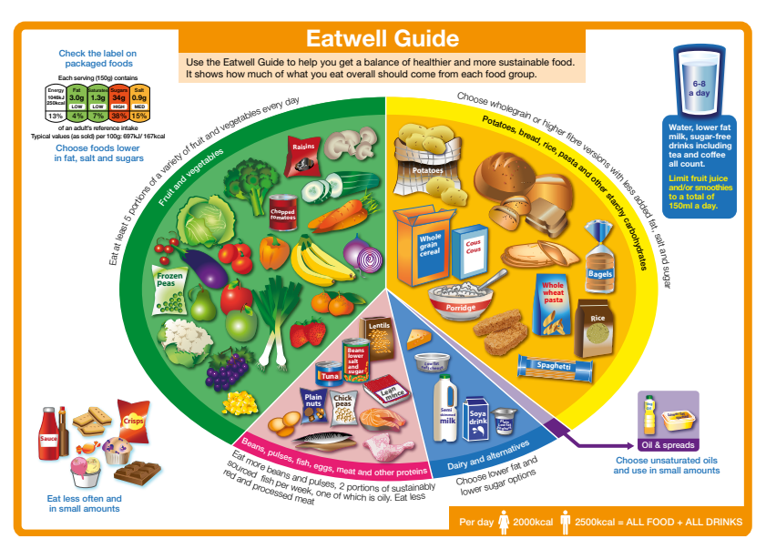
The NHS Choices website, <u>nhs.uk</u> explains how food labelling works.